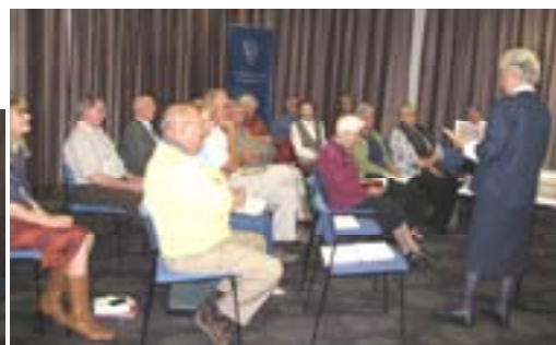
STAFF & VOLUNTEERS